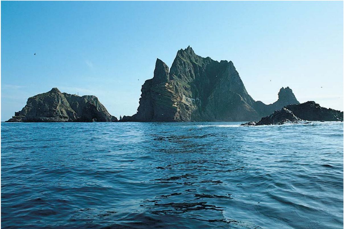
Dokdo, which looks like Sambong (three peaks)

Seongjong). That is, Ulleungdo itself looks like Sambongdo (an island of three peaks) depending on the viewing angle.